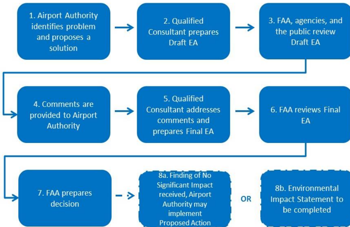
Exhibit 7-2 – EA Process